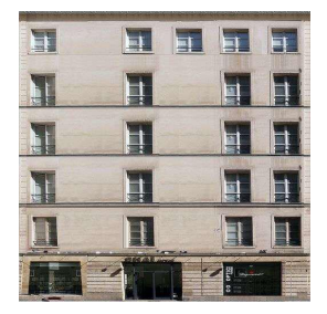
Figure 1: A 2D building "sticker".