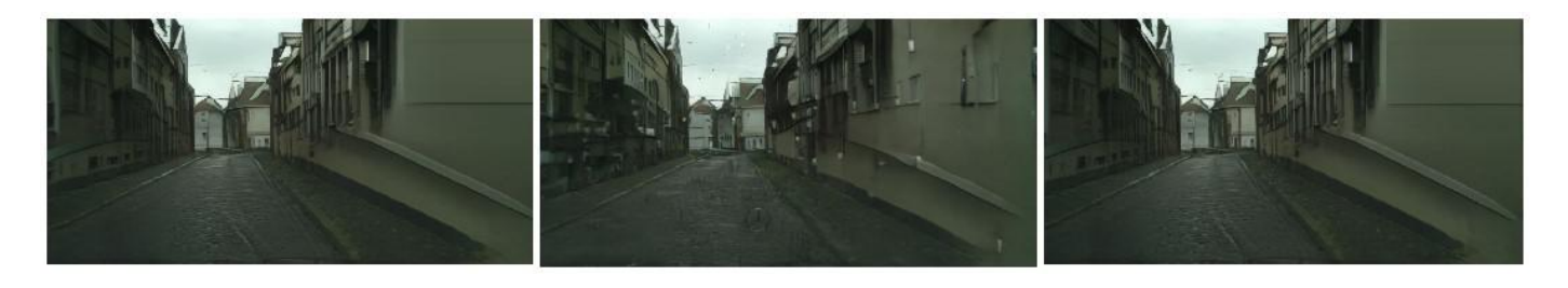
Figure 9: Final results after processing the driving scenes in Figure 8 via vid2vid, which are with different environmental settings of a sunny day, a rainy day and at night (from left to right).