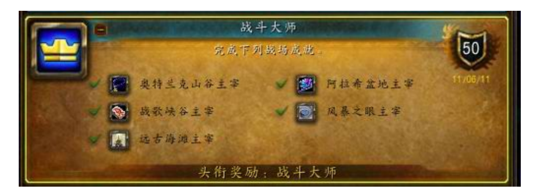
Figure 5, the accumulative PVP achievement 'Battle Master'.

extend the time spent in WOW, if players are interested in getting this achievement.