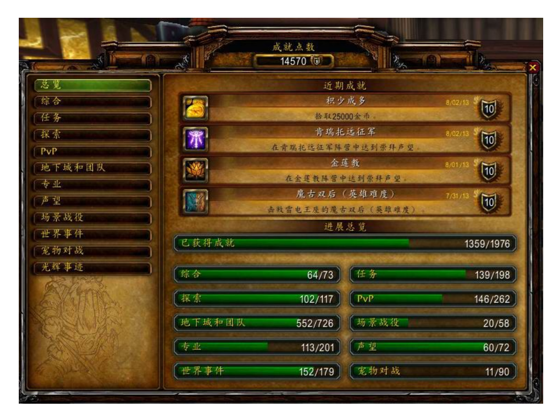
Figure 1, the interface of the achievement system, in the patch Mists of Pandaria.

It is no doubt that these functions to some extent shows what this achievement system might be by unpacking part of its features. To better understand this game system, it is necessary to explore more of its possible functions; therefore, I will discuss two key functions of the achievement system, based on the field notes from my self-play: