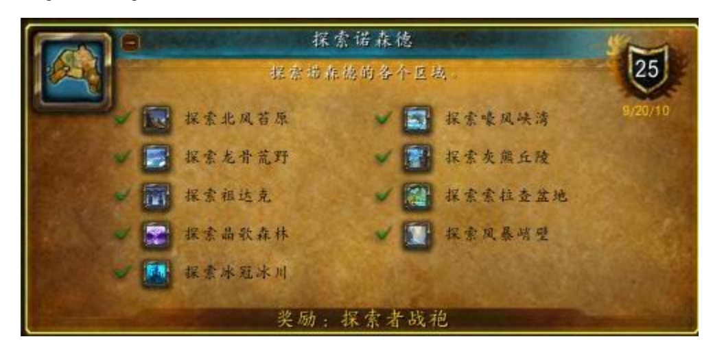
Figure 4, the exploration achievement 'Explore Northrend'.

By introducing the three types of trophies awarded from achievement system, it is clear that they cannot provide any bonus attributes which contribute to the functional growth of game characters; instead, those awards encourage players to experience this game in other ways, rather than only focus on upgrading their equipment, although acquiring loots from bosses is one key reason for WOW players to participate in this game. In other words, those awards provided by the achievement system are not necessities for survival in the game world, but they are indeed very attractive: usually, these awards especially mounts have unique appearance which can be easily identified by other players, and this to a large extent can give players pleasure and satisfaction. As a personal example I remember when I completed the achievement 'Glory of the Firelands Raider'(figure 2) with my raid member and got the mount corrupted egg of millagazor, the first thing we did was riding on this mount and staying in the center of the city Stormwind, to make us become the focus of attention from others. At that time, this achievement was very rare in my server and owning this mount was a symbol of strength, which brought us supreme pride.