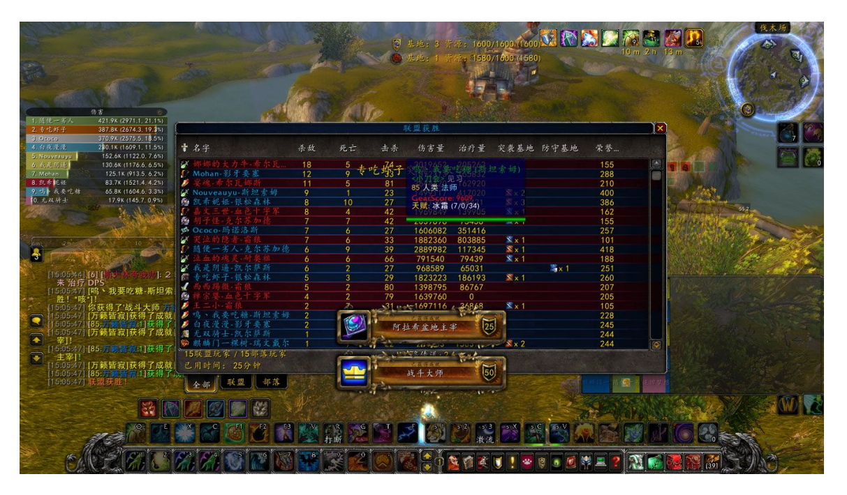
Figure 6, the moment rewarding the achievement 'Battle Master'.

I got this achievement, the figure 6 was the moment when this achievement appeared on my screen, and it is also the last achievement to unlock the achievement 'Battle Master'.