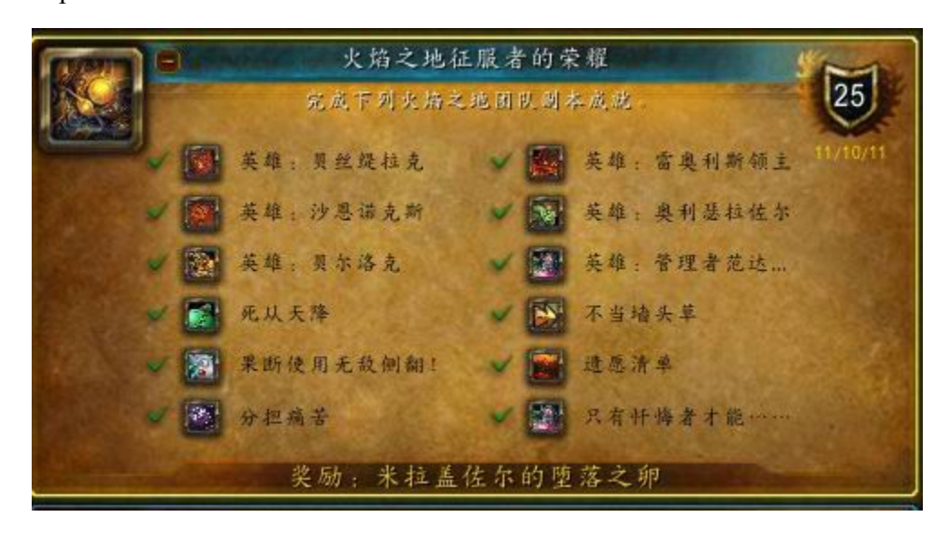
Figure 2, the raid achievement 'Glory of the Firelands Raider'.