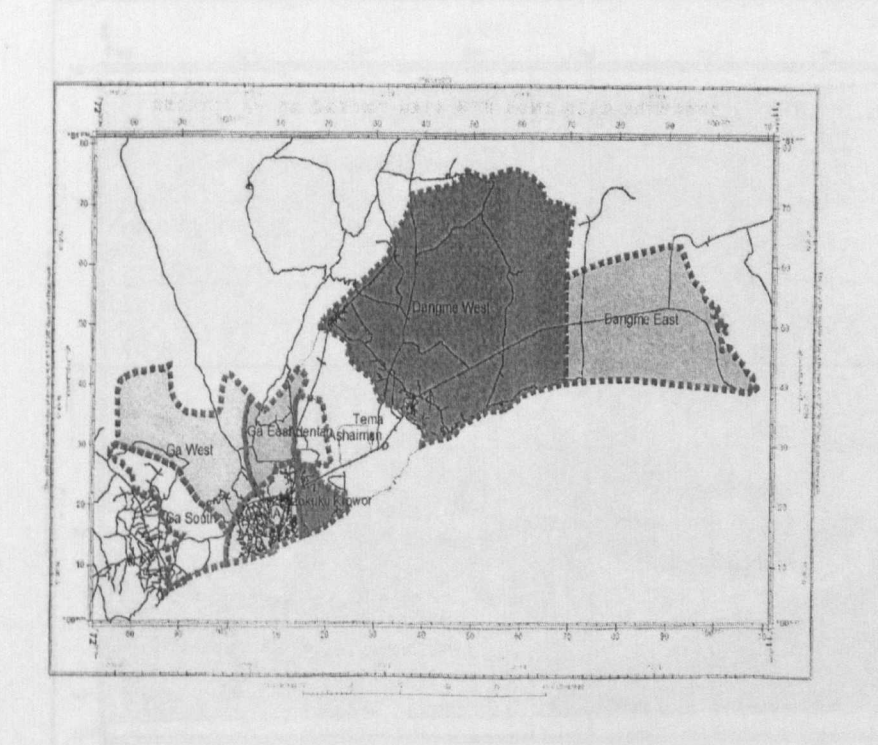
Appendix 5b Greater Accra Region (Showing Divisions)