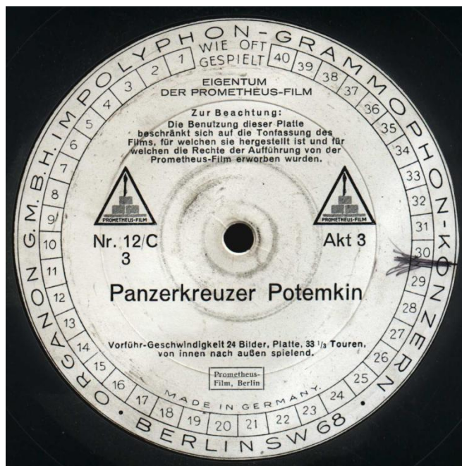
12.1 Label from third Potemkin sound disc, 1930

In 2003, three complete sets of sound discs for the 1930 Potemkin film were unearthed in the Technisches Museum Wien (Tode 2003: 23), enabling some aural analysis. Each set has five discs, corresponding to the original number of film reels (see Figure 12.1 for the label of the third disc). A digital reconstruction and synchronization of the Potemkin sound film has been made by members of the Filminstitut, Universität der Künste Berlin, under the direction of Patalas (Honorary Professor), as part of the project entitled Die digitale Bildplatte [DVD] als Medium kritischer Filmeditionen (DVD as a Medium for Critical Editions of Films) . This reconstruction, discussed briefly in Patalas (2005: 40), is due to be screened at the 2012 Berlinale. From the indication ‘Vorführ-Geschwindigkeit 24 Bilder’ on the record label in Figure 12.1, it is evident that the sound version of Potemkin was projected at standard sound-film speed, 24 fps.