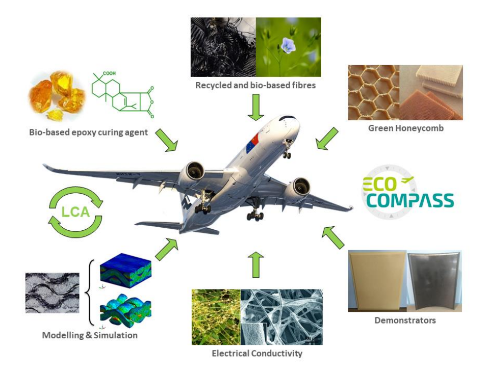
Figure 1. Examples of the materials and technologies developed during the ECO-COMPASS EU/China project.

Starting in 2016, European and Chinese scientists and engineers were working in association in the ECO-COMPASS project to develop aeronautical composites with reduced environmental impact. The overall objective of the project was to provide a preliminary assessment on different types of eco-materials, including bio-based, recycled and multifunctional composites and their usability in aviation environment. This project report aims of providing a short summary of the main findings obtained in the ECO-COMPASS project, and in the following chapter, to provide further recommendations for upcoming research projects on how to improve the properties of eco-composites for application in aviation. The composites under investigation in ECO-COMPASS are made from naturally renewable resources, like plants and recycled carbon fibers with added functionality, where acoustic, vibration and electrical behavior can be tuned according to design needs (Figure 1). It was the objective of the joint effort to trial-manufacture secondary and interior structures for aircraft by using these newly developed material systems. The threshold for the introduction of new materials in aviation is comparatively high because of the challenging safety requirements, such as fire performance criteria for materials used in the cabin environment [3,4].