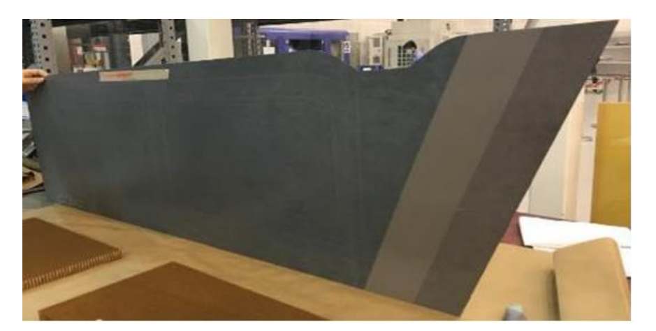
Figure 4. Demonstrator trailing edge panel of a horizontal tail, an example for the combination of conventional materials like carbon fibers with partly bio-based epoxy resin developed during the ECO-COMPASS project

be found in journal articles published by the consortium during this international collaboration [2–27] and public deliverables on the project website.