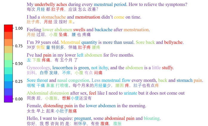
Figure 3: Heat map of word weights calculated by the ABLSTM model

Experiments are also conducted to evaluate the performance of rule-based method with RF features and ABLSTM features calculated by two approaches introduced in Section 4.3. Results in Table 4 illustrate that the ABLSTM feature captured by the occurrence filter mechanism outperforms the other two approaches. Taking into account both the word weight and frequency of occurrence, the occurrence filter is able to determine keywords that are semantically relevant to the specific medical scenario, as it filters out the words with either low weight