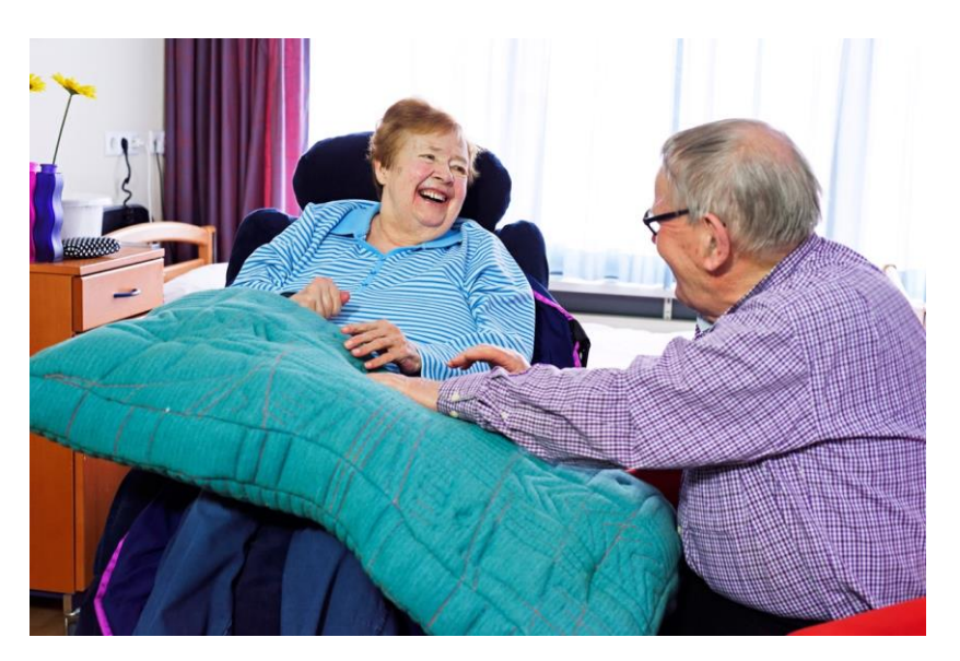
Figure 1. Interacting with Tactile Dialogues.

In collaboration with these stakeholders, the designer created a concept called Tactile Dialogues; a textile artefact in the form of a pillow with integrated vibration elements that react to touch (Schelle et al. 2015) and supports as such a dialogue between a person with severe dementia and a family member or (other) caregiver (see Figure 1). The design of Tactile Dialogues follows a phenomenological and humanistic design philosophy, rather than focusing on purely medicalization and quantification (Høiseth & Keitsch 2015; Møller & Kettley 2017). Consequently, the Elderly Care Organization coaches the users to adapt Tactile Dialogues to their specific needs (e.g., people can use the vibration for subtle massage or more intricate communication patterns).