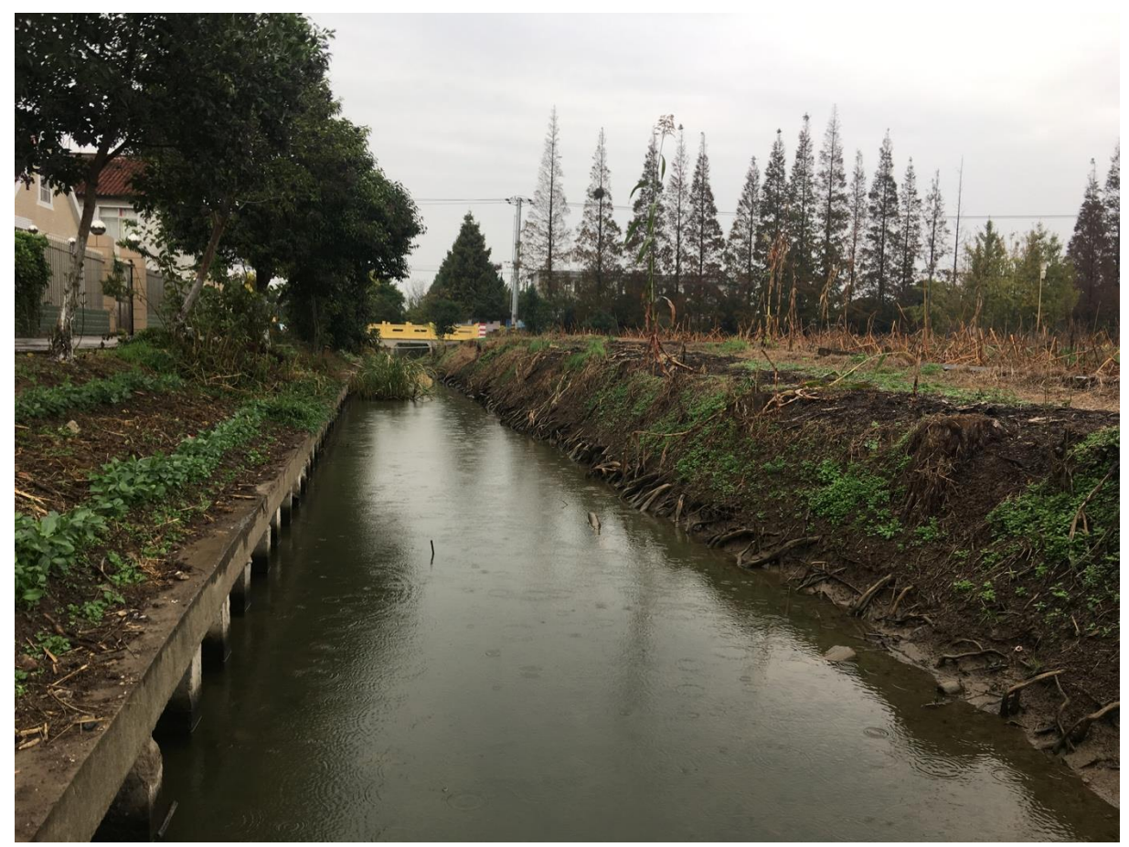
Figure 4: Trees were cut down and their roots remain by the riverbank

socio-environmental results (Bryant and Bailey, 1997; Neumann, 2005; Peet et al., 2001; Robbins, 2012). The case of the transformation of Chongming river governance vividly illustrates the detrimental consequences that can arise when community-led river governance, that draws upon and reproduces local expertise, is replaced by a top-down perspective that relies on external professional knowledge and delivery practices and fails to sufficiently recognize the sensitivity of the local environment. The detachment of local communities from the management of their environment, and consequent adverse experiences for the Island's ecology, is repeated for land management as we shall see below.