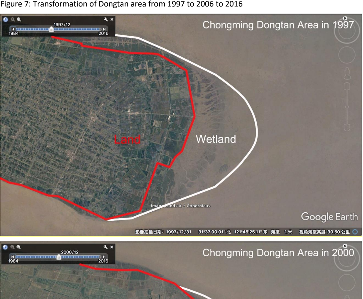
Figure 7: Transformation of Dongtan area from 1997 to 2006 to 2016