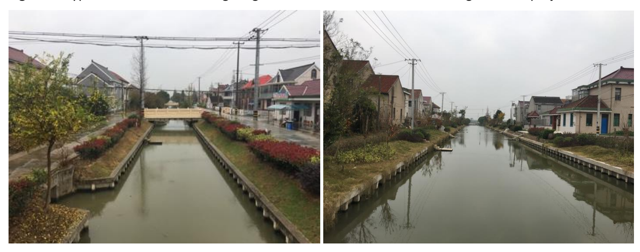
Figure 2. Typical riverbanks of Chongming that have been transformed during the river projects