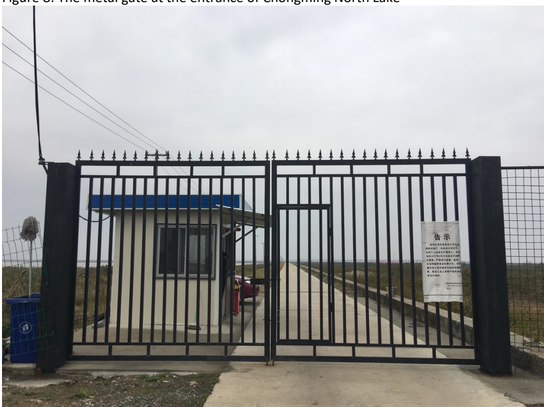
Figure 8: The metal gate at the entrance of Chongming North Lake

On our field trip to the North Lake in March 2018, a metal gate and a fence that is miles long blocked us from entry to the site (Figure 8). The notice attached to the gate says, "The Chongming North Lake area is a legally owned property of Shanghai Tidal Land Requisition Company. It is strictly forbidden for any individual or unit to enter without the permission of the company". The signing date is February 7, 2017. As the "legally owned property" of STLRC, North Lake is now an "enclave" that falls outside of Chongming's planning and administration. Since the North Lake reclamation project, STLRC has reclaimed a total of 182 square kilometres land on the three islands of Chongming County/District (Wu, 2017). Being directly managed by the municipal government, Chongming government is left to provide help with routine supervision<sup>18</sup>.