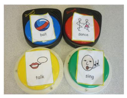
Fig. 1. Four Jellybean switches labelled with the symbols representing the microswitches' action

or a joystick. In this way, executing the program corresponding to the server and running the appropriate behaviour in Choregraphe it was possible to tele-operate the robot with different input devices.